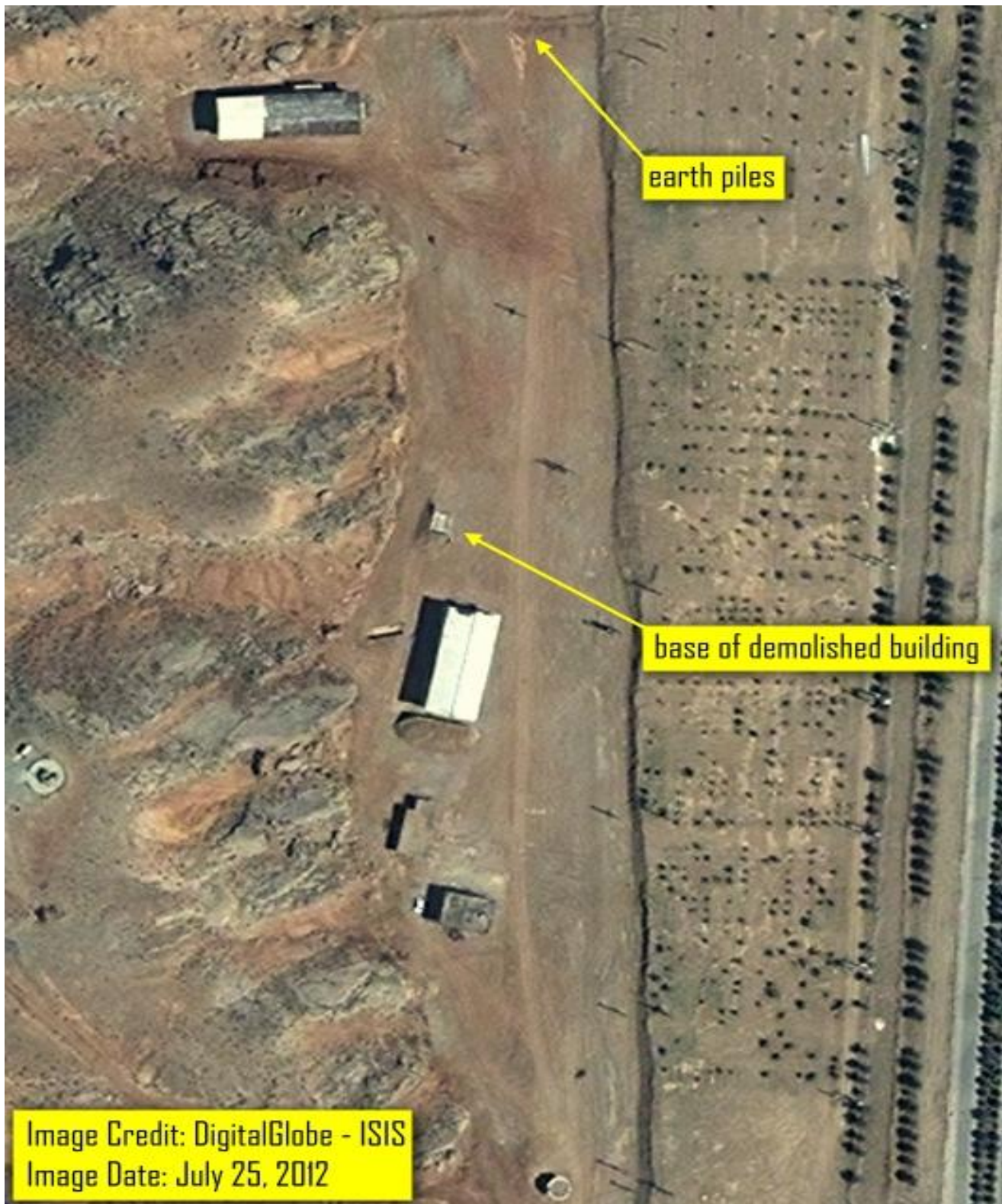
Figure 3: Imagery from July 25, 2012 showing what appears to be the final phase of major demolition and earth moving activities that heavily altered the site over the course of four months. The original state of the roofs of the two buildings later covered with tarpaulin is clearly visible in this image.