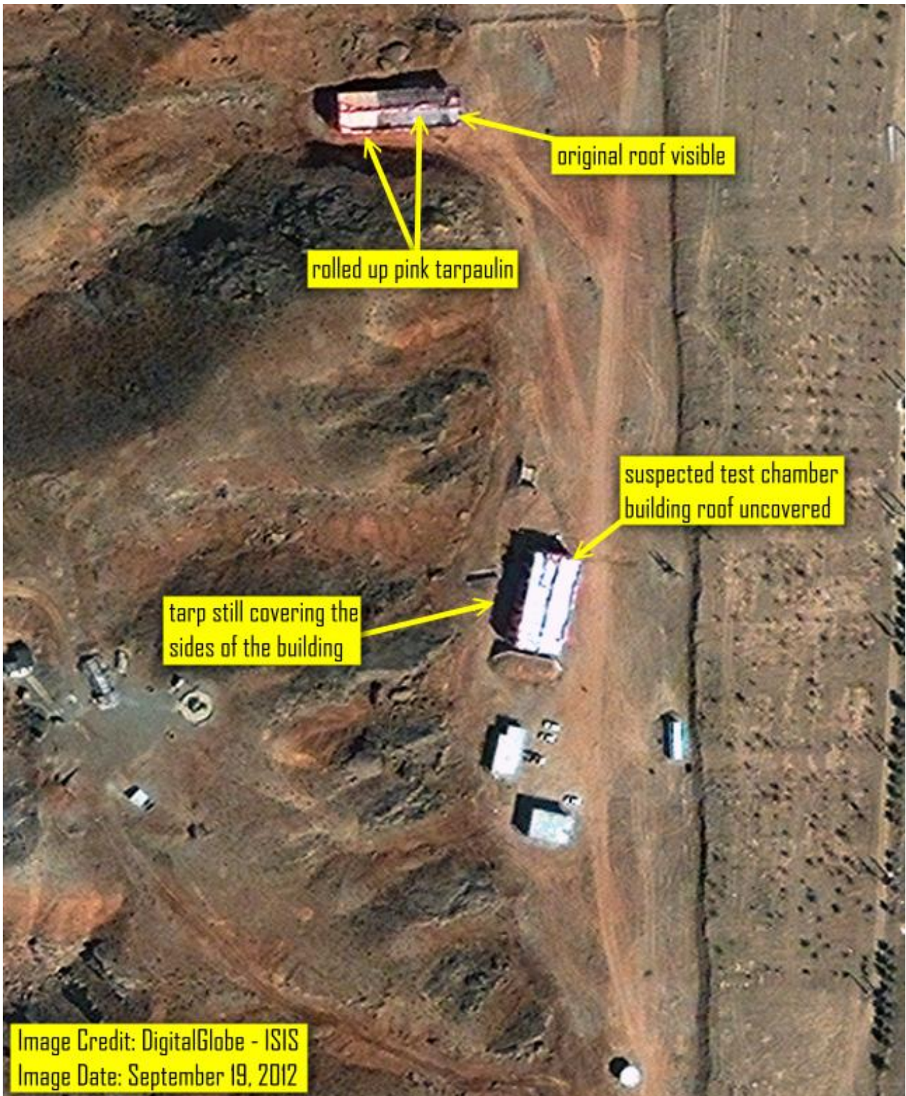
Figure 1: In the latest satellite imagery, the covers placed on the two major buildings at the Parchin site seem to be in the process of being removed. The original roofs of the two buildings are now visible, as are rolled up lines of pink tarpaulin.