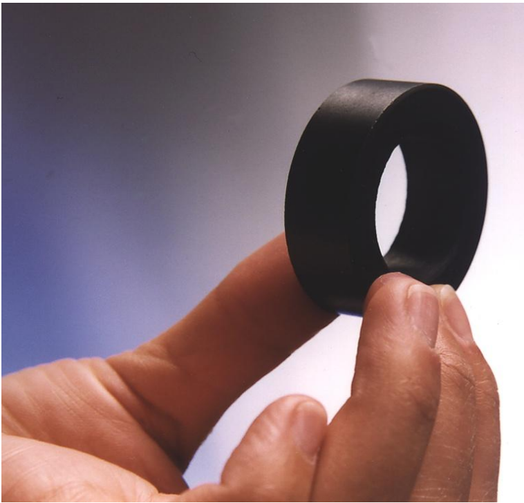
Figure 1. IR-1 ring magnet.