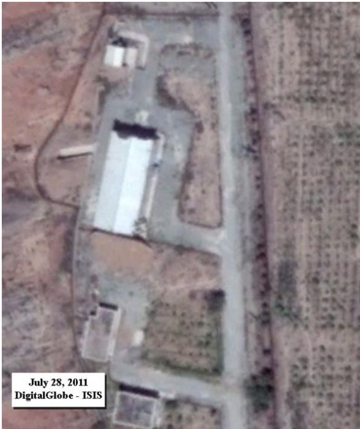
Figure 3. July 28, 2011 commercial satellite imagery of the site shows the building absent any other activity. The activity seen in the April 9, 2012 satellite image is not present in any other ISIS satellite imagery of this building, indicating that the activity seen is not a regular occurrence.